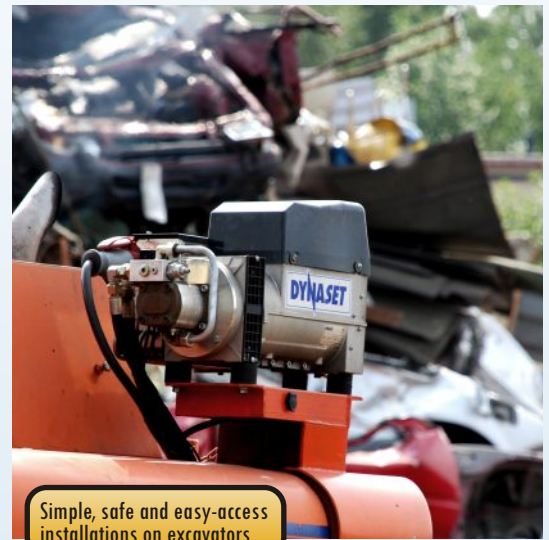
Simple, safe and easy-access installations on excavators