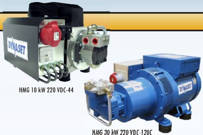
HMG 10 kW 220 VDC-44

Generator can be equipped with a junction box for high quality auxiliary electricity for tools etc.