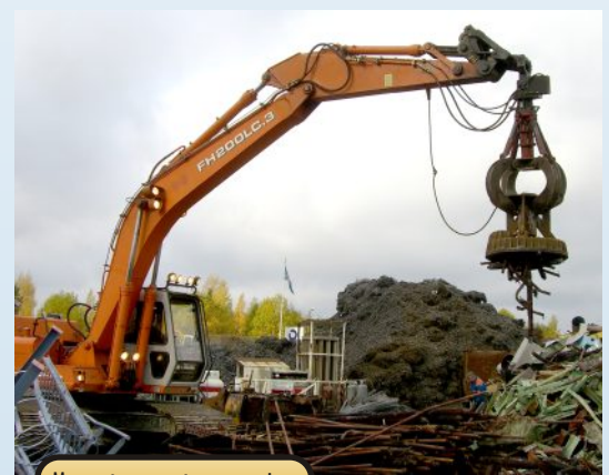
Magnet generator powering a hydraulic grab magnet installation at a scrap yard