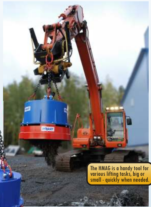
The HMAG is a handy tool for various lifting tasks, big or small - quickly when needed.

The excellent features of the hydraulic magnet make it a profitable tool. It greatly improves work efficiency and flexibility, and expands the possibilities of the work machine.