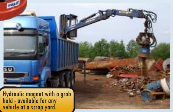
Hydraulic magnet with a grab hold - available for any vehicle at a scrap yard.